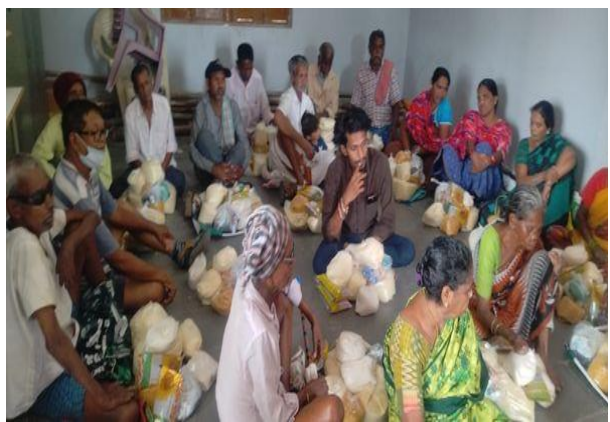
In a joint endeavor, the Association of People Affected by Leprosy (APAL) and Brighter Future Development Trust

On 24<sup>th</sup> August 2024, In a joint endeavor, the Association of People Affected by Leprosy (APAL) and Brighter Future Development Trust (BFDT) convened a significant gathering at the Jagannath Leprosy Colony in the Mancheswar Industrial Area, Bhubaneswar, Khordha, Odisha. The assembly facilitated the convergence of representatives from both organizations and members of the leprosy-affected community to deliberate on prospective collaborative endeavors aimed at ameliorating the circumstances of those impacted by leprosy in Odisha. The congregation provided a forum for comprehensive discourse on the existing challenges confronting the leprosy-affected populace in the locale, particularly the substandard living conditions and dearth of adequate assistance.