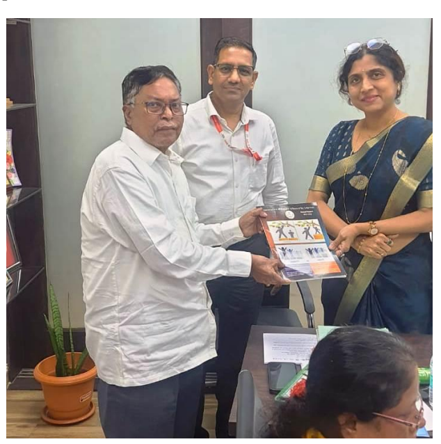
APAL's state committee in Telangana, in collaboration with Share the Vision Swa Chanda Seva Sansthan, distributed essential commodities

The presentation marked a pivotal moment in bridging vital information between APAL and key governmental health authorities, fostering collaboration and informed decision-making for the betterment of public health initiatives in Maharashtra.