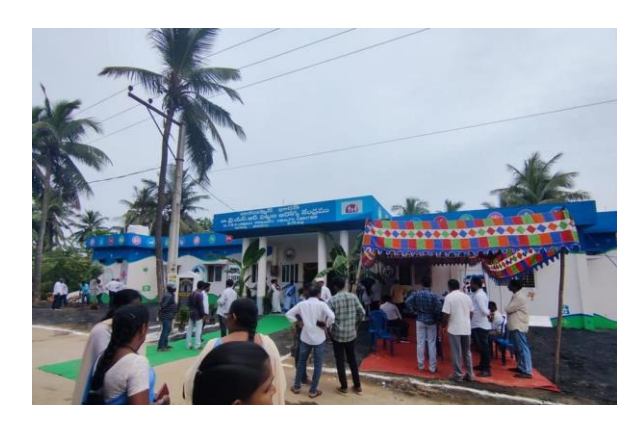
The Government of Andhra Pradesh has recently sanctioned and distributed disability pensions to 20 individuals affected by leprosy

On 5<sup>th</sup> September 2023, The Government of Andhra Pradesh has recently sanctioned and distributed disability pensions to 20 individuals affected by leprosy and persons with disabilities at Jyothi Nagar Leprosy Colony in Bhimavaram, Andhra Pradesh. This initiative was made possible through the efforts of APAL's state committee in Andhra Pradesh.